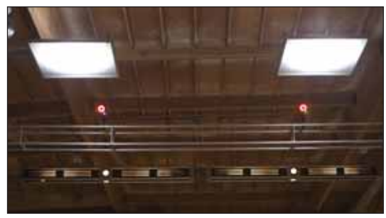
Above: The milk-Plexi panels. Opposite, top and bottom: The studio area. Center: The workstations.

The result is a space that facilitates the staff's work, both with motioncapture cameras and computer