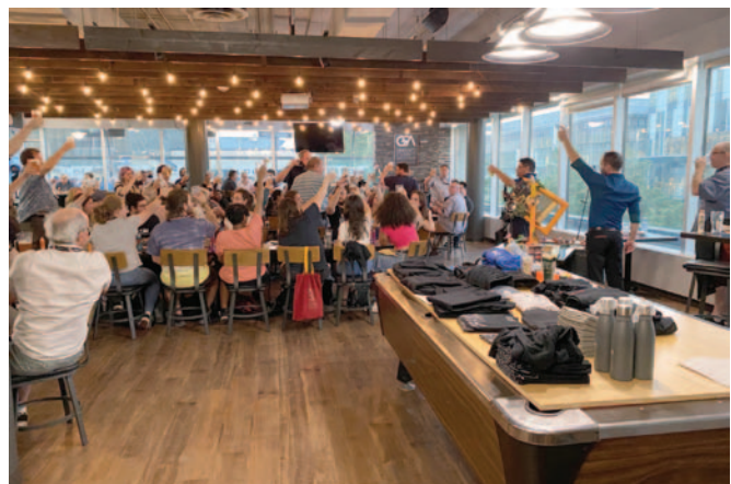
More than one hundred participants gathered to play bingo and raise money for The AFC.

I look forward to what the next couple of years will bring, both their challenges and successes.