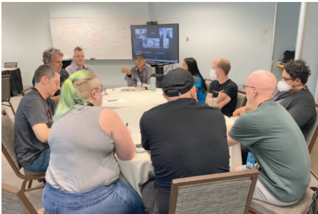
Participants sharing and discussing work ideas at the "Making it Happen: Technician to Miracle Worker Roundtable."