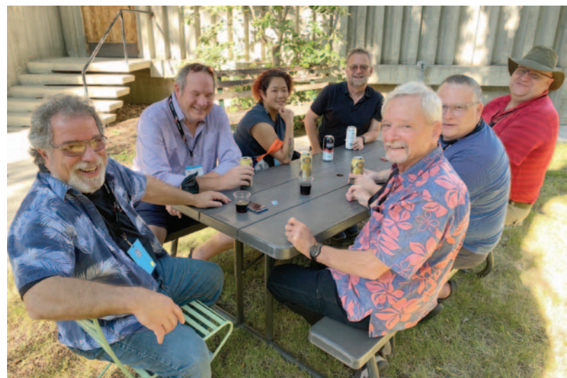
Members and presenters enjoying some laidback time at Rendez-vous 2022 Closing Reception.

almost 1,500 visitors and 70 exhibitors. The success of EXPO-SCÈNE relieved significant pressure on CITT/ICTS's finances and has enabled us to resume mostly normal operations.