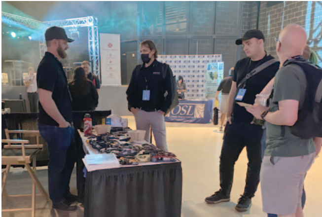
Rendez-vous 2022 trade show at the MacEwan Hall.