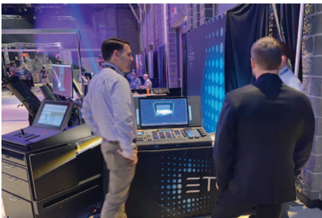
Rendez-vous 2022 trade show at the MacEwan Hall.