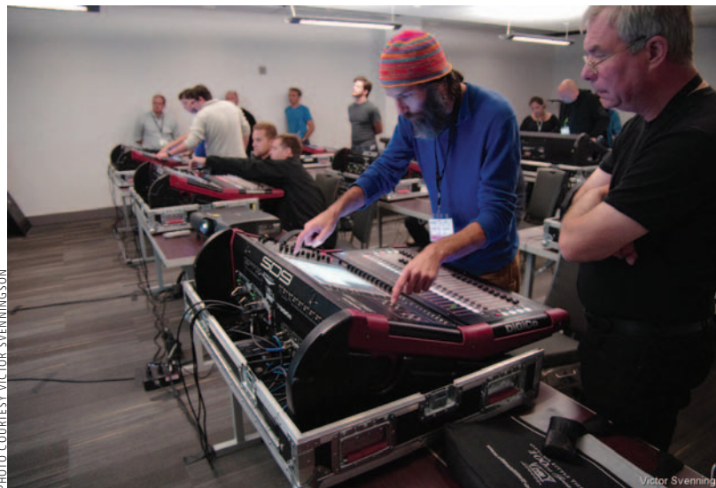
Audio console training at Rendez-vous 2014