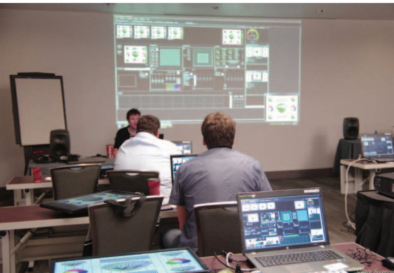
Media server training at Rendez-vous 2014

“ [Moving the] annual training conference to Whitehorse . . . address[es] three key issues: lack of skilled technicians in the north, limited access to technical training in the north, and the recruitment of First Nation emerging technicians. ”