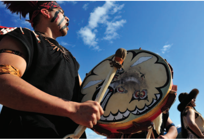
Dakhká Khwáan Dancers