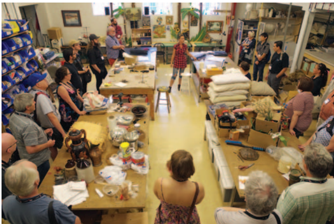
Foliage Workshop – Past and Present Painting Techniques at Rendez-vous 2018 in St. Catharines, Ontario