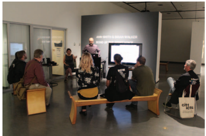
Gallery Lighting at Rendez-vous 2019 in Whitehorse, Yukon