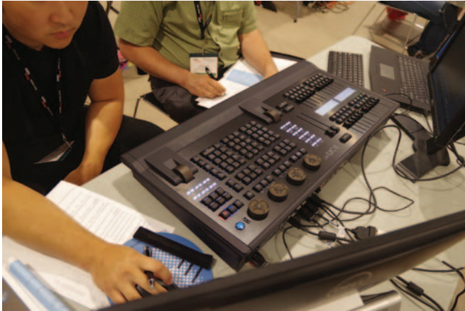
Two-day ETC Ion Console Training at Rendez-vous 2018 in St. Catharines, Ontario

Trade show exhibitors take center stage at the Product Showcase Breakfast. They will have a minute or so to showcase their product or service during this analog show & tell. A fun prelude to the trade show!