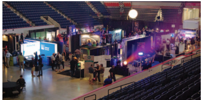
Trade show floor at Rendez-vous 2018 in St. Catharines, Ontario

The programming of the conference aims to bring together professionals and students alike around the most relevant and current topics close to our industry, in order to share ideas and knowledge, best practices along with new ways of doing, practical expertise and accessible resources to the community.