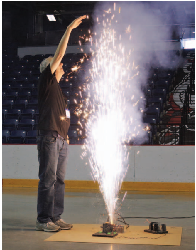
ERD Certified Pyrotechnics Safety and Legal Awareness Course at Rendez-vous 2018 in St. Catharines, Ontario

The Annual General Meeting is an occasion for the CITT/ICTS Board of Directors to present the 2021 – 2022 annual report with the financial statements, to introduce the elected board members, and to discuss the future of the organization.