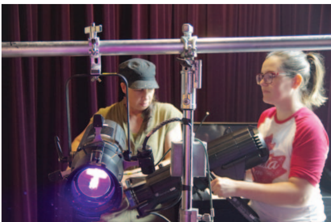
Lighting Diverse Skin Tones with Tungsten and LED at Rendez-vous 2018 in St. Catharines, Ontario