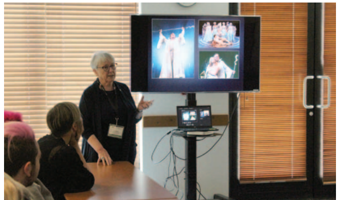
Beyond Off Shelf at Rendez-vous 2019 in Whitehorse, Yukon