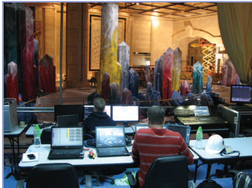
Programming the lighting for the Wishing Crystals.