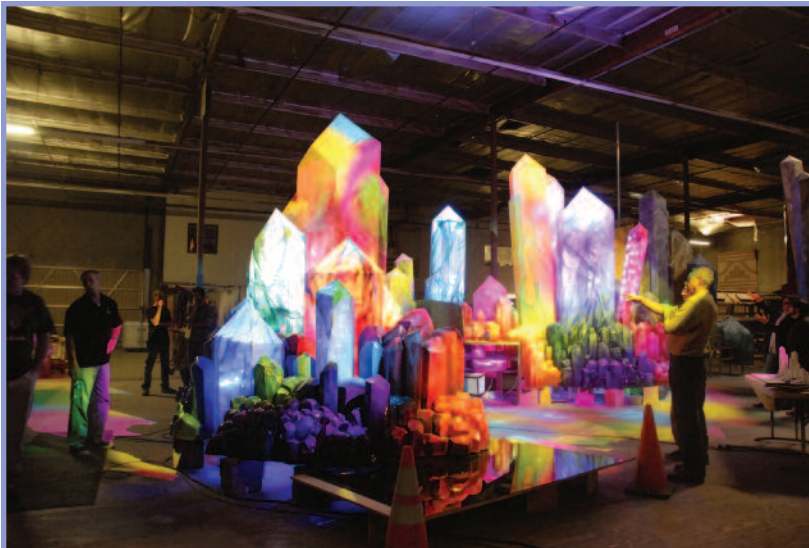
The Wishing Crystals under construction.