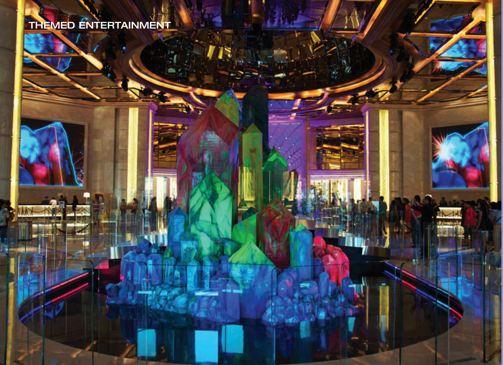
This view takes in the two 30'-by-24' Lighthouse LED walls that are featured in the show, and are also used for in-house ads and promotions.

the real color would be with the real material; it's very easy to be fooled by renderings or tests that aren't using the actual material," Antone explains.