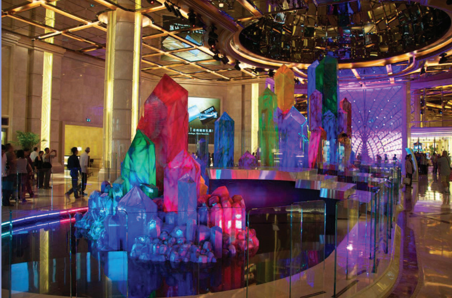
The Wishing Crystals inside the 20'-wide-by-200'-long black reflective pool, intersected by three bridges.

bestowing diamond, Lui had other ideas. Specifically, he wanted something to enliven the casino's day-tripper entrance. "It is for all of these people who come over from mainland China in hundreds and hundreds of buses," says Railton.