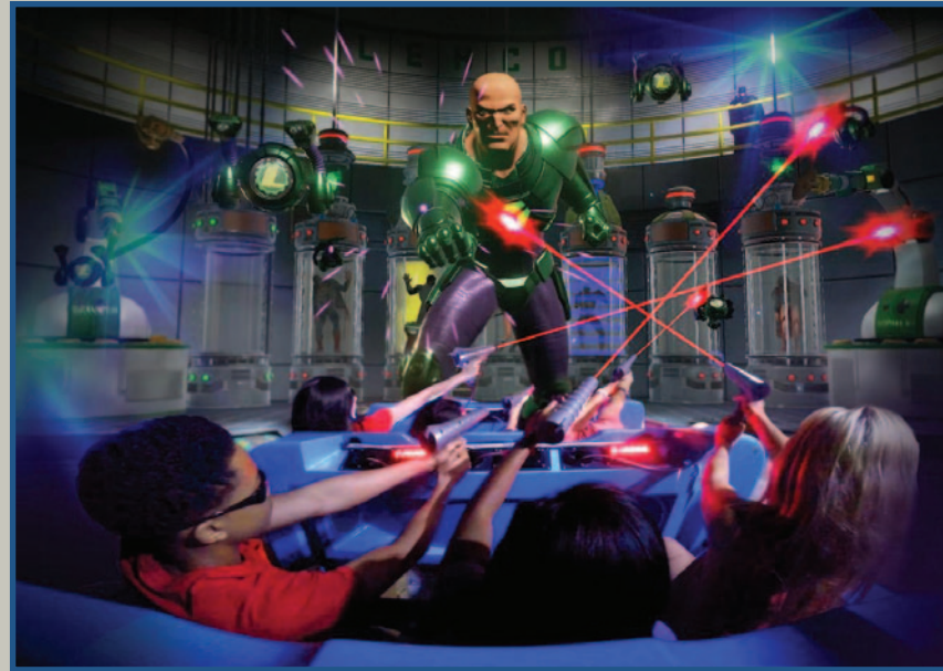
Doing battle with Lex Luthor.