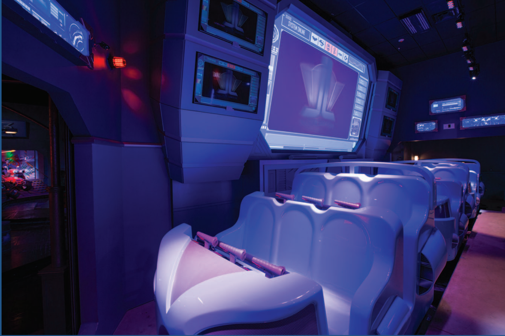
The custom motion vehicle, developed by Oceaneering, is equipped with Alterface interactive devices for shooting at bad guys.

punishing daily schedules. Well before ride track was laid, Hansen had roughed out how the lighting would work and where the fixtures would go. “We walk the ride at several stages and start finding focal points even before the scenery is actually there,” he says. “Every night, we go back in fresh, to see what is working and what needs to be changed. In theatre, I can run a cable later. Here, I have to get those outlets in place before we build the ride. Also, if I make it difficult to get to and maintain a light, there’s a good possibility it won’t be maintained down the line. And I have to design in sustainability. I can’t do a punch-twist gobo—they have to be able to reorder. This ride has to last for at least 10 years in all environments and conditions.”