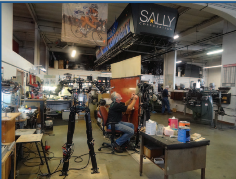
Cyborg under construction.

is that the colors are so pure, almost cartoonish, they add much to the story.”