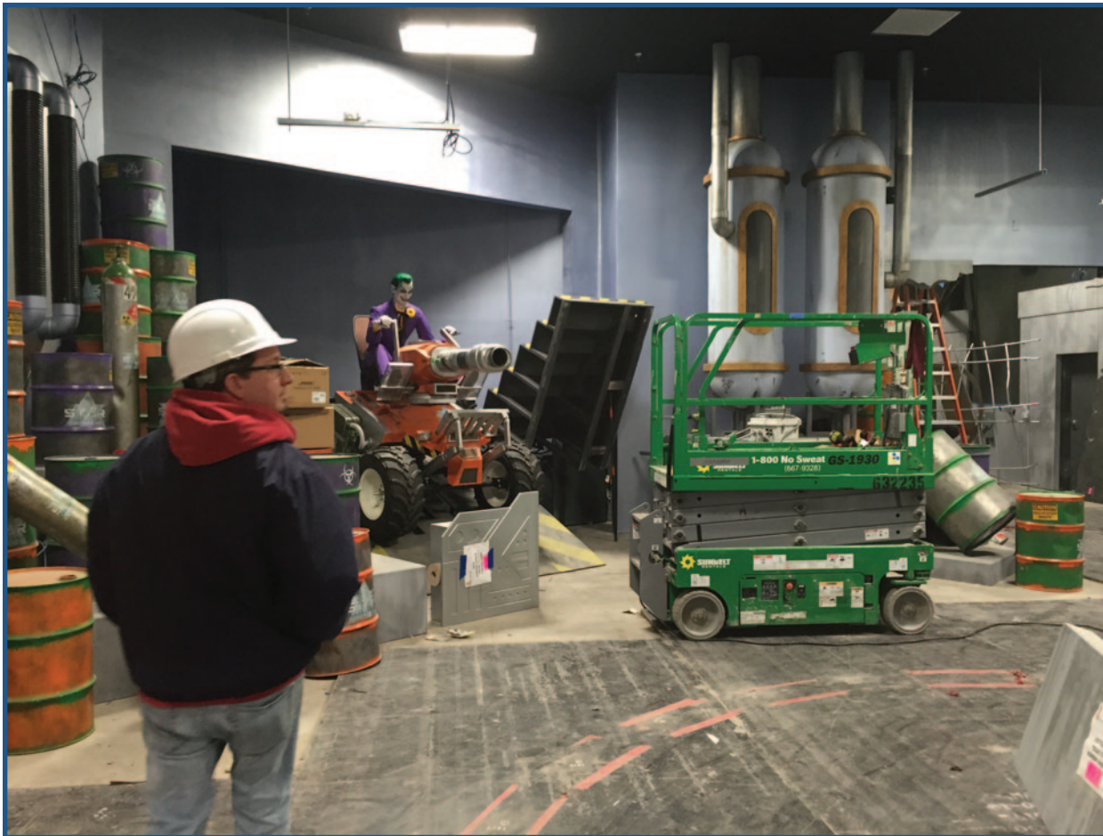
The Joker's laboratory lair, shown here in progress with Sally Corp.'s animatronic already in position, is an elaborately detailed scene with physical props, theatrical lighting, and special effects.