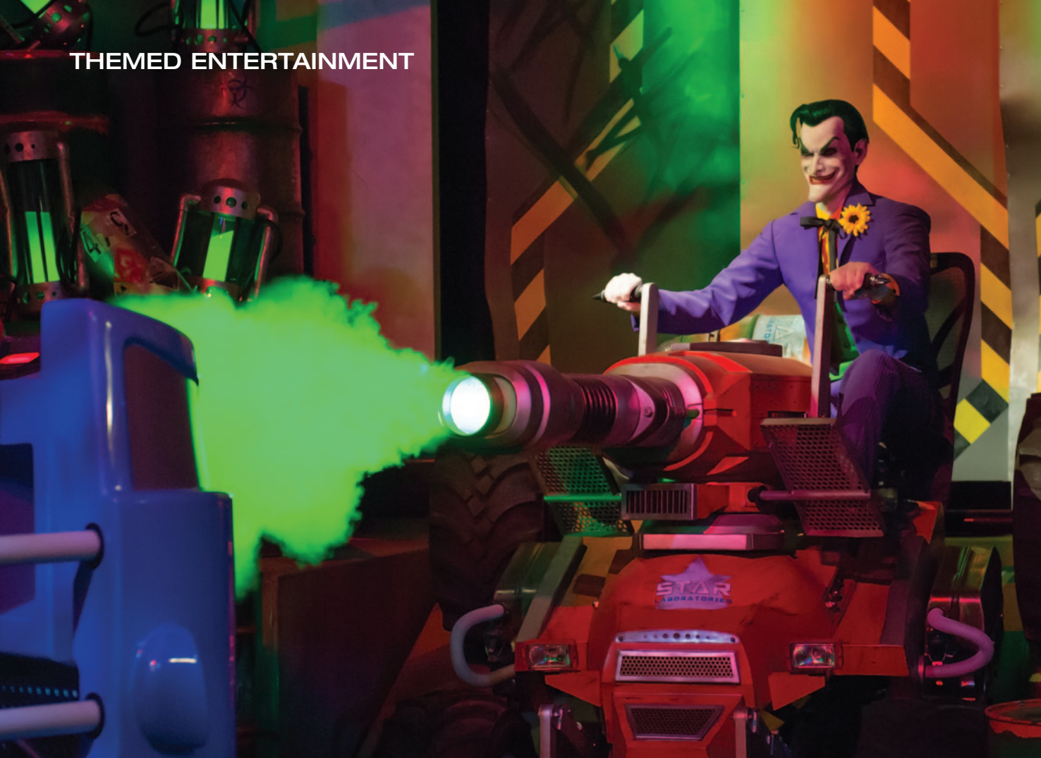
Doing battle inside the Joker's laboratory.

with the projected media. The Unreal 4 game engine, from Alterface, enables real-time game play with a laser and camera scoring system. Ride designers were able to designate pretty much anything as a target, and guests can choose their shots based on their knowledge of the story and who the bad guys are, rather than seeking out a specific target shape. This plus the real-time response of on-screen action, helps the experience feel realistic and intuitive. 3-D projection was provided by RealD. Alterface provided the media playback servers.