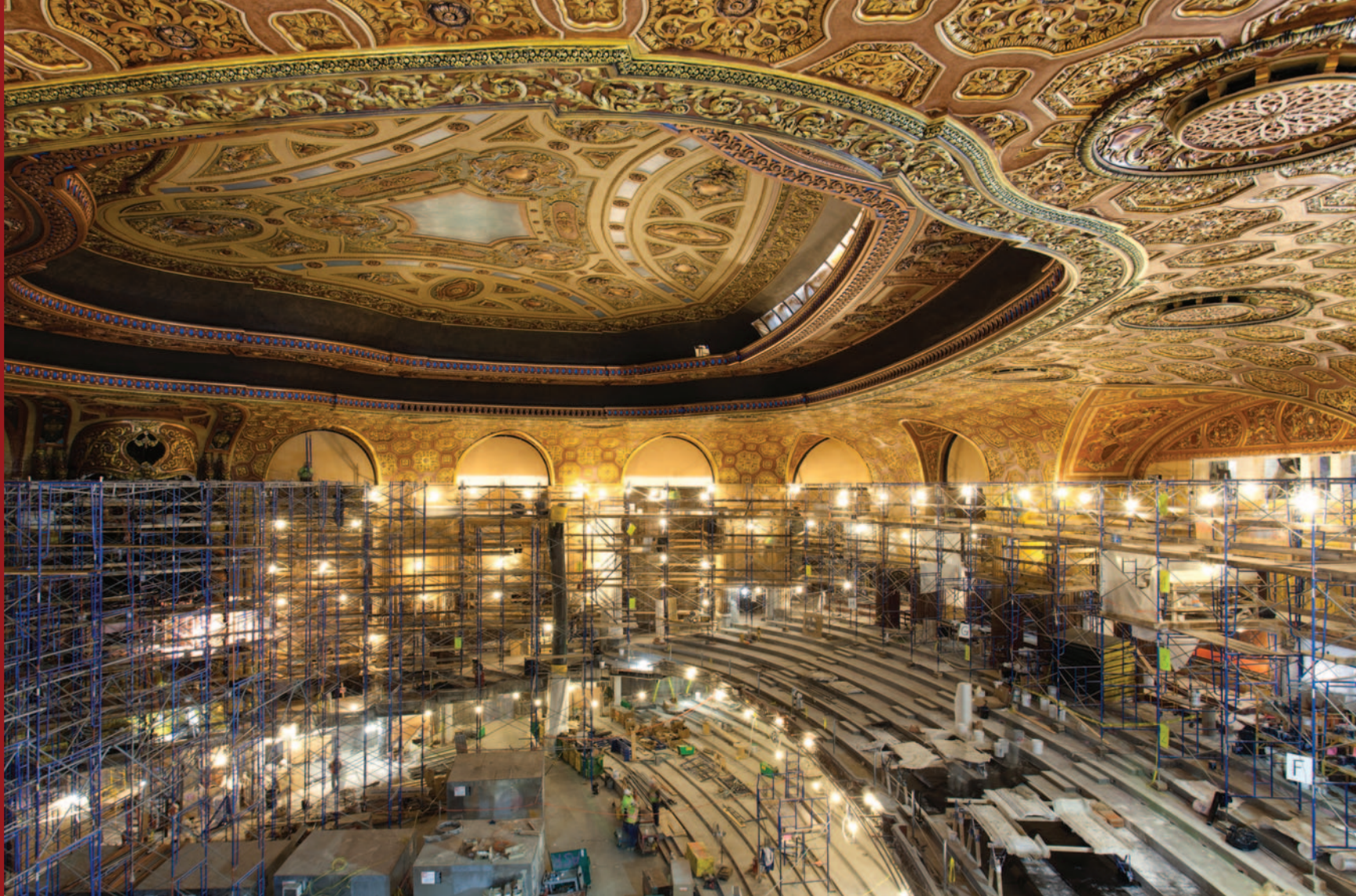
The renovation in progress; EverGreene Architectural Arts restored the decorative walls and ceiling.

remove the entire stage house, which would allow us to reorganize things. In the end, we put in a small, add-on bustle, but we kept a lot of the original stage house. We kept the back wall, but took out all of stage right and expanded it; in doing so, we changed the way the entire rigging wall was set up.”