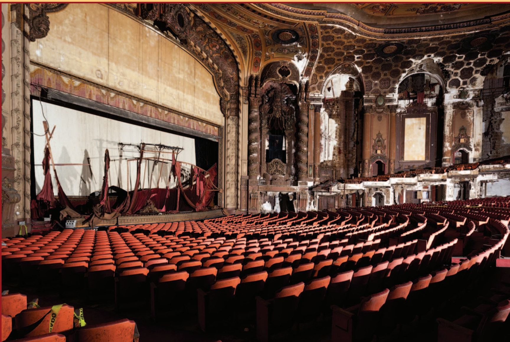
The auditorium, before the renovation. The water damage on the house right wall was especially bad.

The theatre’s stunning interior was reportedly more or less intact as late as 1977. In 1980, it was seized for back taxes, and was officially acquired by the City of New York in 1983, allowing some structural repairs to be implemented. But over the next three decades it fell into a state of near-ruin. Water damage played havoc with much of the gorgeous interior detail, and, according to the website Curbed , “Looters ransacked the building in the nearly 40 years it sat unoccupied,” tearing out everything including copper wiring. Steven Ehrenberg, director of production at the Kings Theatre, says, “It was some of