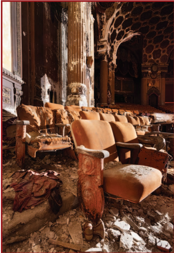
The theatre's seating was in a state of ruin.