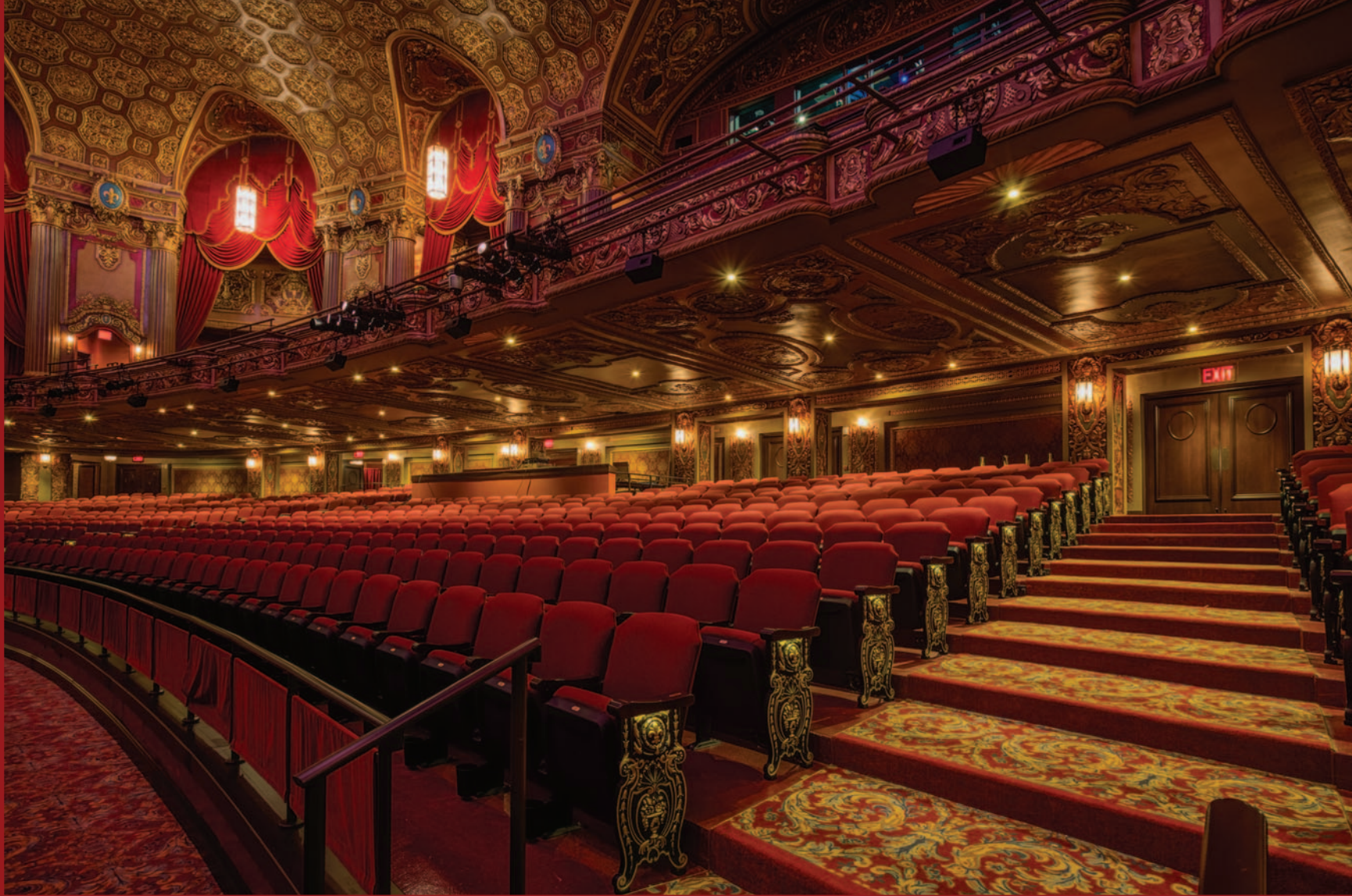
The seating was re-raked in order to improve the theatre's sightlines. The seating was supplied by Irwing Seating.

program monitoring, as well as video to the dressing rooms," says Nittoli, "as well as an extensive infrastructure—audio, video, analog, and digital. You never know when an act will drop in an analog desk. We also did an assistive listening system." The paging system features control by Rane, microphones from Shure and Sennheiser, and speakers by Soundtube. Other available mics for on-stage use are by Shure. The assisted listening system is by Williams Sound. The intercom system is by Clear-Com. The video system includes a camera and backstage television by Panasonic, lobby monitors by Samsung, and video distro by Link Electronics. Acme Professional, based in New Market, Maryland, supplied the sound gear.