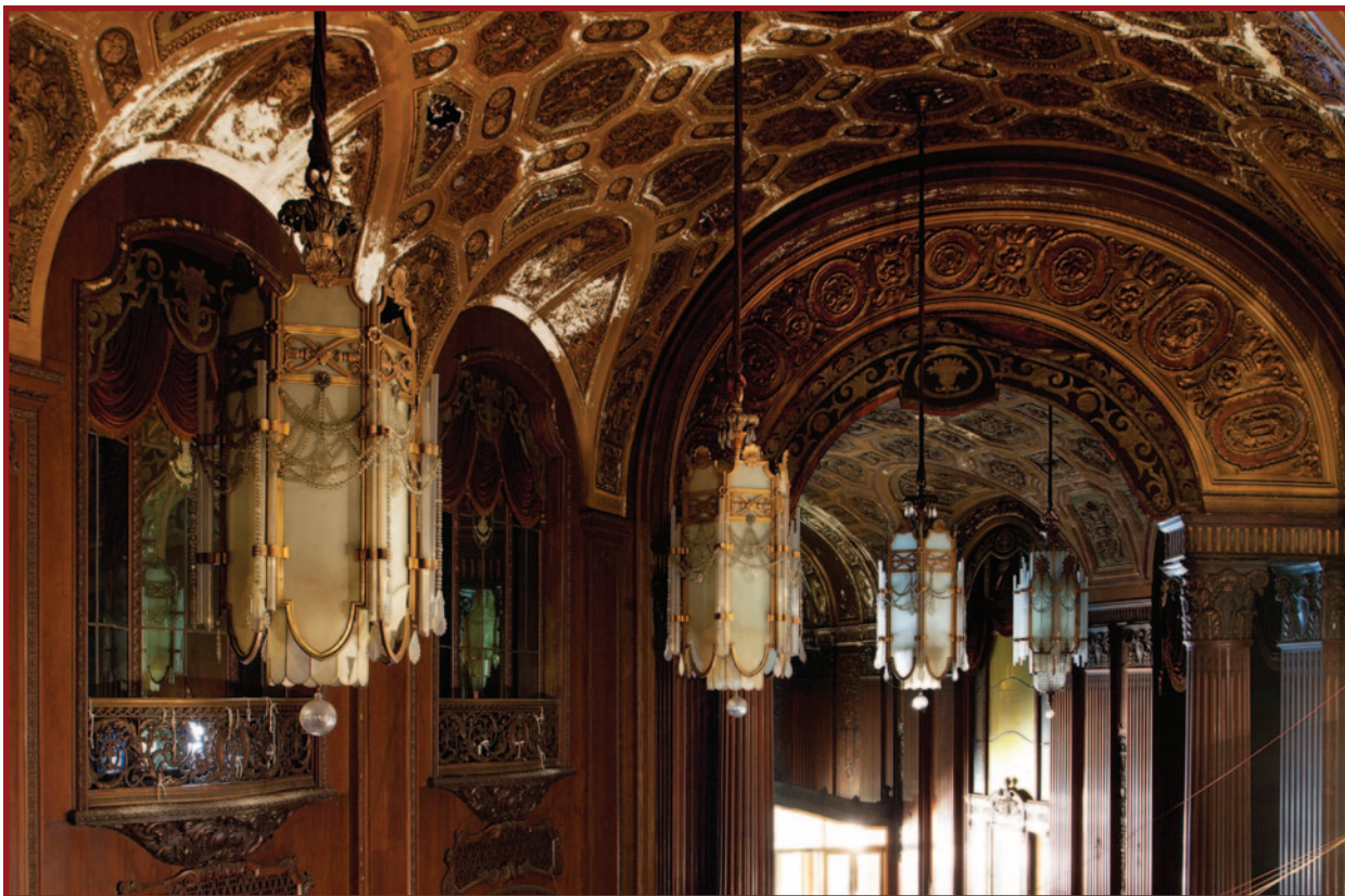
Above: These original chandeliers in the front foyer were hung too high to be stolen by the looters who plagued the theatre over the years.