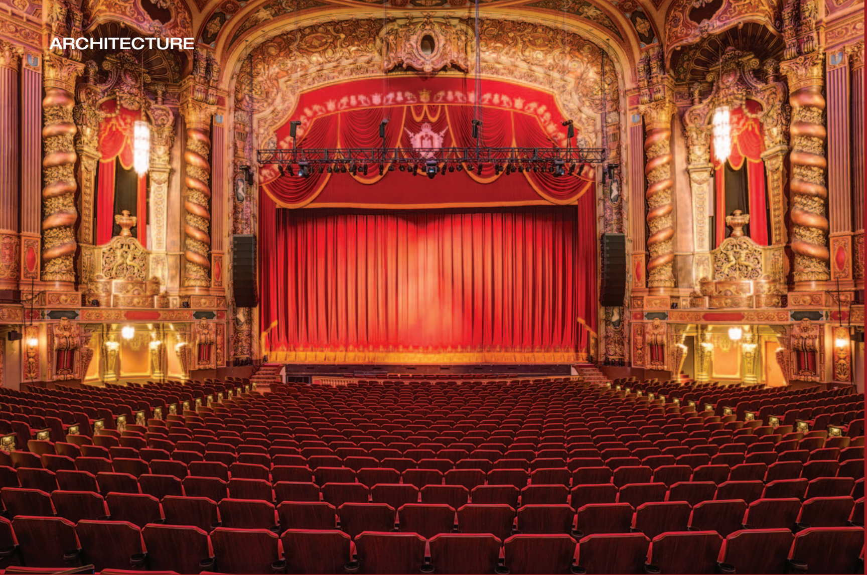
The restored auditorium has also been retrofit with new technology, most of which has been installed with an eye toward not conflicting with the design. The curtain and other draperies were supplied and installed by iWeiss Theatrical Solutions.

And, like the rest of the team, Todd notes that he and his staff worked to implement changes to the room's acoustics, trying to make them as invisible as possible. "The wall surfaces are either acoustically diffusive or we made them highly absorptive, then tweaked the absorption to address the bass energy in the room," he says. "The French Baroque detail creates the diffusion; we worked with the architects on materials to create the absorption. The plan was to enhance what the room already provided rather than trying to make it into something it isn't." Still, he notes, "You'll see heavy absorption in the panels on the rear wall, and 50% of the side walls feature absorption in the form of heavy drapery, with the other 50% being the diffusive surfaces of the French baroque style."