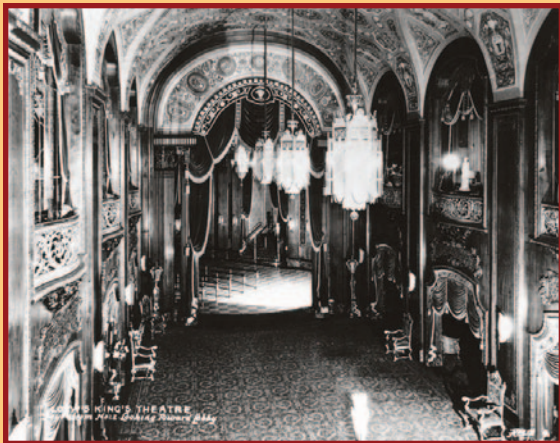
Above and right: The lobby and auditorium in 1929. Left: The restored lobby.