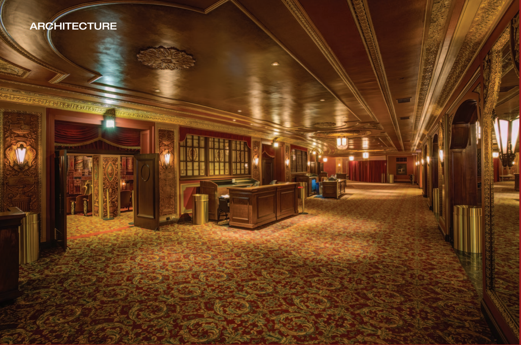
The lobby and foyers acquired 2,354 sq. ft. of historically replicated carpet. New concession areas were added, to meet the expectations of contemporary audiences.

review board.” All of these changes were necessary, he adds, “It was a different time and the building had a different purpose. People who go to the theatre today have certain expectations. We always ask, what does it take to make it into a 21st-century theatre?”