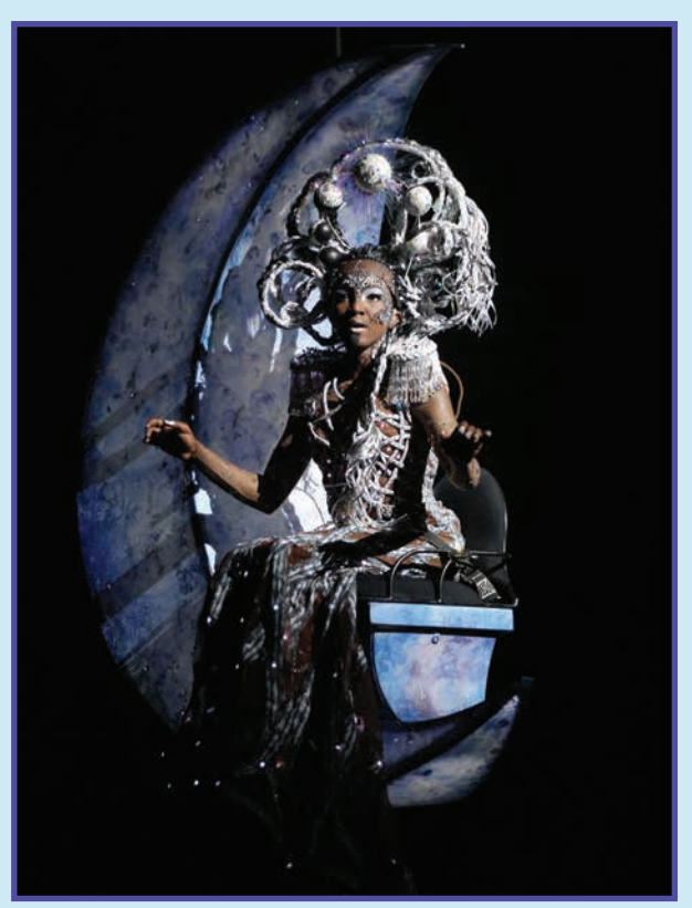
Left: Mephisto, a key part of the set and the show, is a sprawling mechanical monster composed of TVs, cameras, microphones, and tungsten bulbs. Above: Ngame, the Mother Moon.