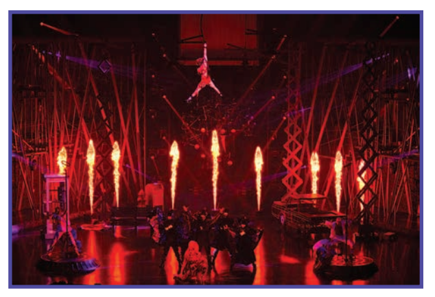
The stage also includes 66 winches, which move at speeds of up to 12' per second.

time that I had a team with this much experience. More and more, I see that MJ ONE was the result of six years of work on other shows, and it went so smoothly. We did a lot of work, but, technically, it was amazing."