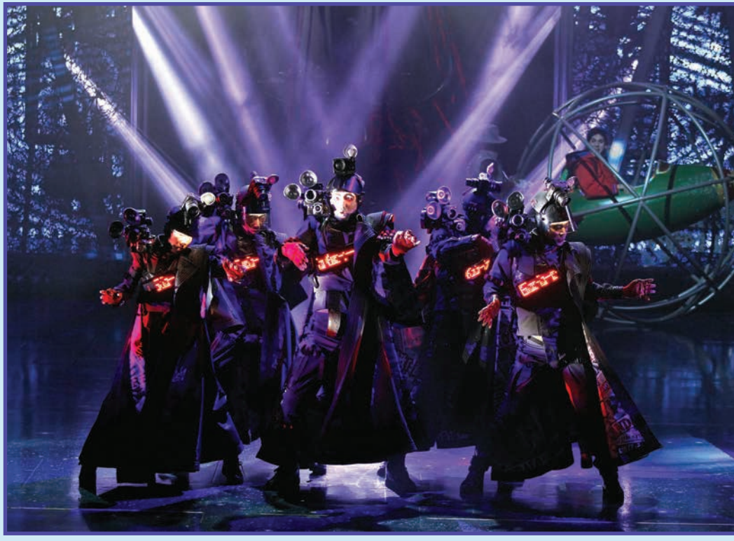
The rocket that appears during "Tabloid Junkies" is meant as a nod to Michael Jackson's music video for the song "Leave Me Alone."

The automated rigging system includes two "winch farms" with individual control of up to 59 motorized winches. An automated trolley system with individual winches flies performers and scenic elements over the audience. All of the automation is networked using one of three fiber-optic networks that synch the automation, lighting, and audio-video systems. Each system also has a