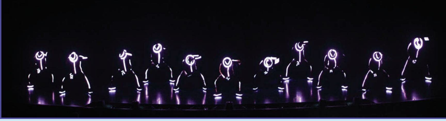
Of the more than 7,000 LED lights in the show, many custom LED elements are integrated into the costumes, and the set pieces themselves have nearly 300 built-in LED fixtures.