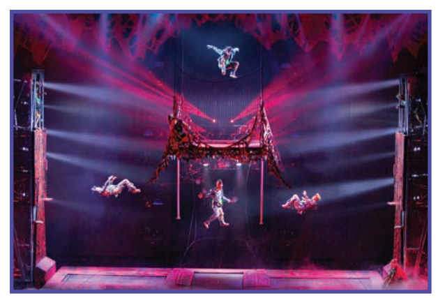
Two 96' overhead tracks have two acrobatic trolleys each for the moving artists, some of whom fly over the audience.