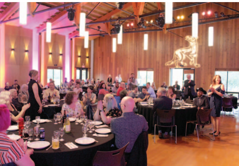
CITT/ICTS 2019 Awards Banquet