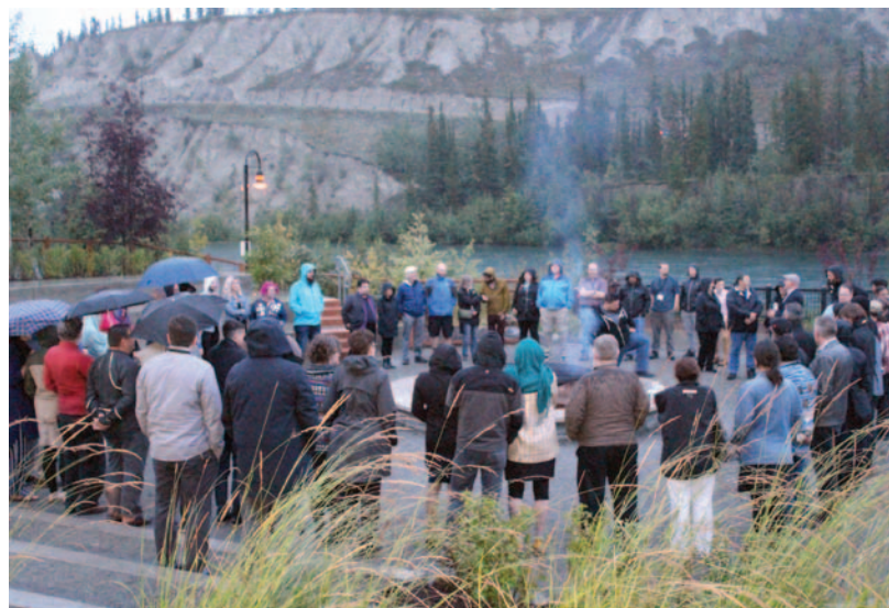
Kwanlin Dün Cultural Centre with the Firekeepers

Also an emerging artist of the Montréal music scene, her interests revolve around the professionalization of artists and cultural workers and the betterment of their working conditions. She recently started working as coordination assistant at the CITT/ICTS national office where she had the opportunity to take part in Rendez-vous 2019.