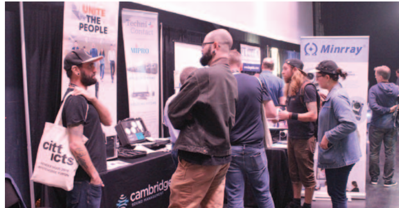
CITT/ICTS Annual Trade Show on the Yukon Arts Centre stage