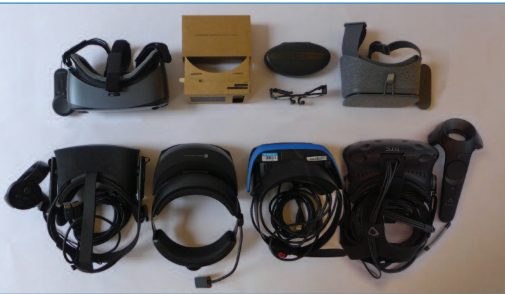
Above and below: Agile Lens' lineup of VR headsets.

with a VR-ready graphics card.” Viewable on a number of devices, including the HTC Vive and Oculus Rift, it offers increased graphic fidelity and performance. On the Agile Lens website, one can use this format to view the grounds surrounding the Statue of Liberty Museum, designed by the firm FX Fowle, which is due to open on Liberty Island in 2019, and a design for a project known as “Cliffside Pavilion,” which allows the viewer to toggle between different iterations of the design. In a forthcoming download, for the Stephen A. Schwarzman Center at Yale, the viewer can teleport around the space and even change the lighting configuration.